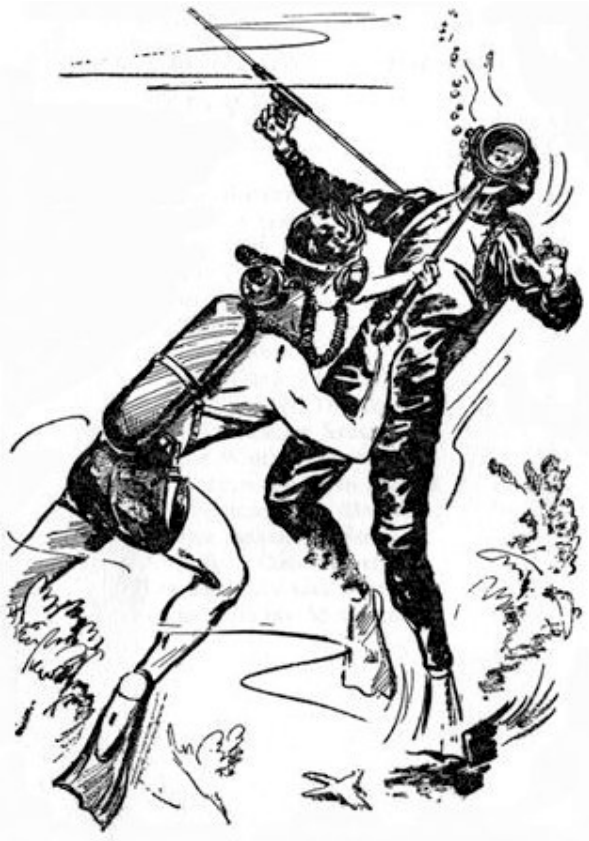
With his spear Scotty jerked off the enemy frogman's face plate

swimming at his side and a little behind. After a few yards Scotty dove again, into clear water. Rick looked around but could see no sign of the enemy. Apparently the frogmen had followed and were still in the murk.