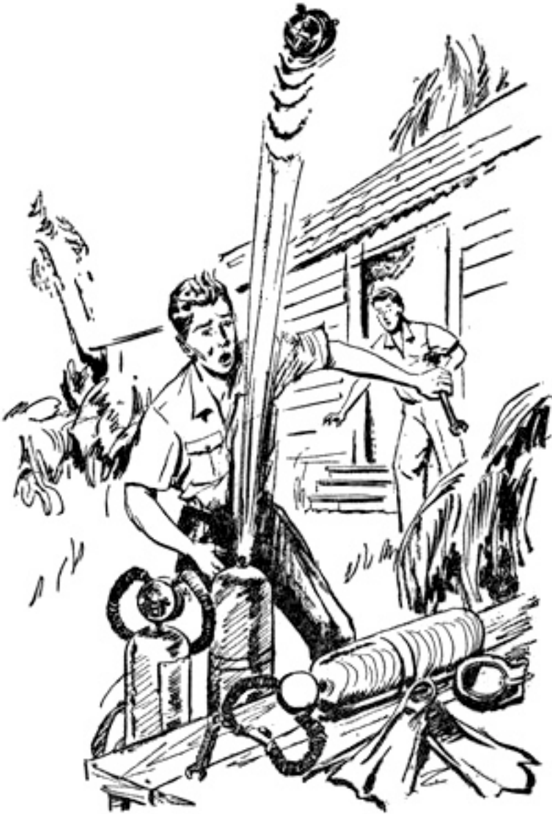
The valve assembly, traveling with bullet speed, barely missed Scotty's head