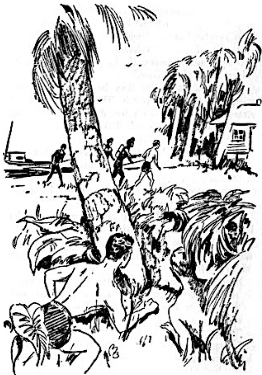
Rick nudged Scotty to back away

"I'd like to see the bedrooms," a third voice said. Rick thought it belonged to the man they had taken off Steve's tail.