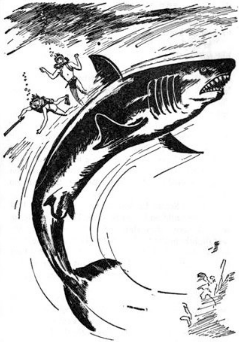
Rick turned in time to see a six-foot shark speed past

toss, either. Not when the chicken had been weighted with a fishing sinker big enough to carry it to the bottom. Tony and Zircon would never do such a thing. Besides, they had no chickens.